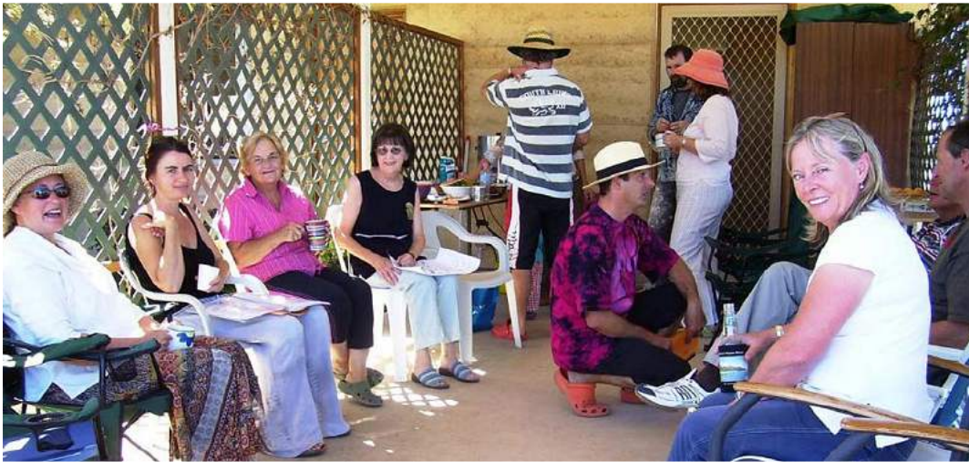
ABOVE: NEIGHBOURHOOD MEETING GROUP 8 (CLEMATIS WALKERS)