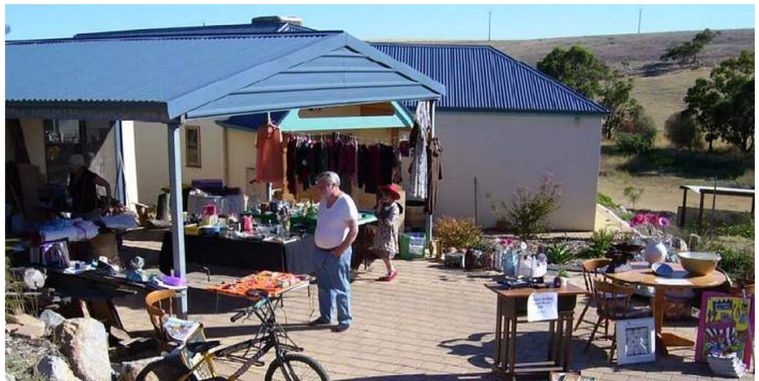
ABOVE: HAKEA WALK SOME OF THE ITEMS ON DISPLAY DURING OUR VILLAGE GARAGE SALE