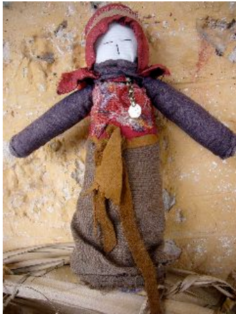
Jenni Worth, One Face Doll , natural materials

ella-mental an ELEGANTLY ORGANIC EXHIBITION at 16 Yacca Way, 173 Port Road, Aldinga (Aldinga Arts and Eco Village) 20 – 21, 27 -28 February 4 - 7 and 11 – 14 March 10am – 5pm Official opening 2pm Saturday 27 February 2010